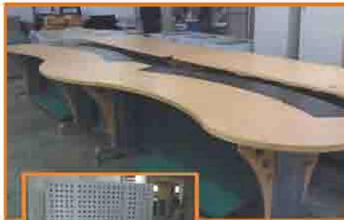
▲ Wooden Operator Console