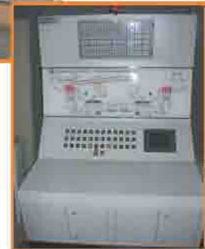
Control Desk with Mimic