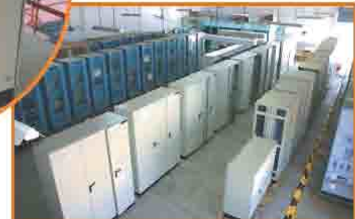
Birds view of Ware House