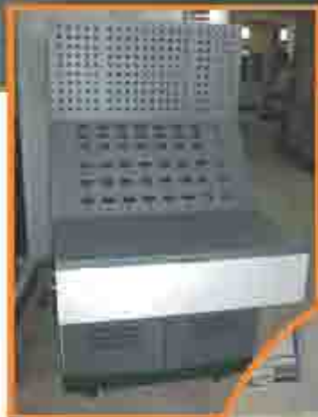
▲ SS Control Desk