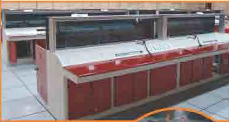
▲ Console Array