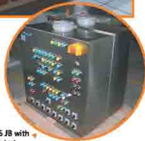
SS JB with Swivel