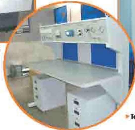
▶ Test Bench