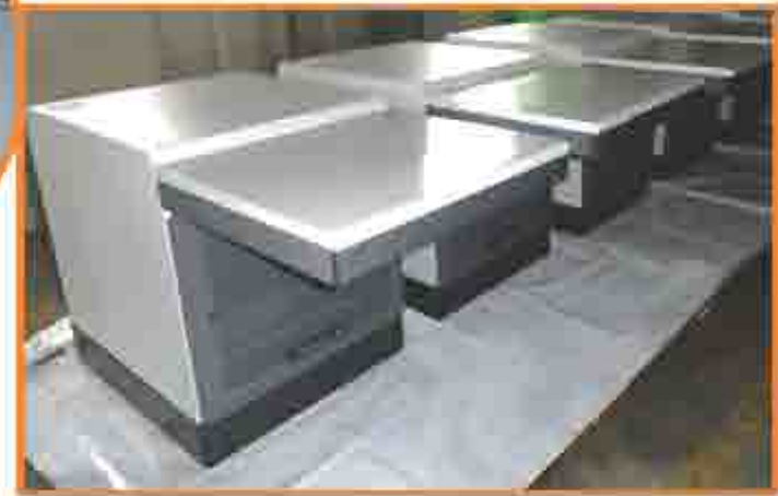
▲ Console Array