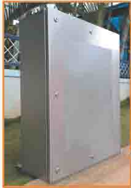
▲ SS Junction Box-Big