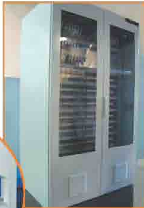
▲ PLC Panel