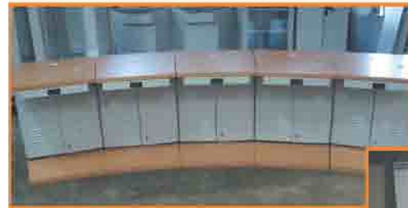
▲ Wooden PC Consoles