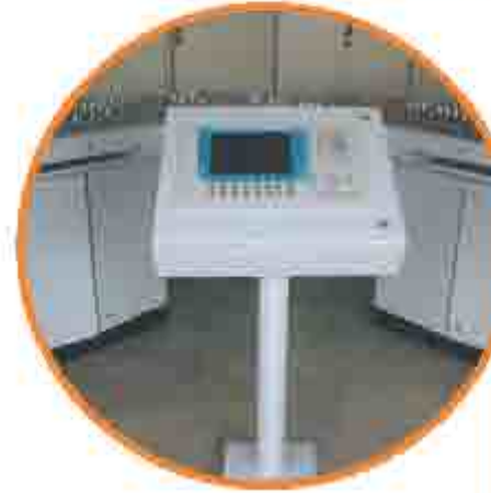
▲ Pedestal Controller